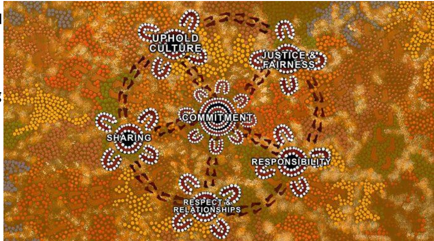
Interpretation of NHMRC 6 core values for the central Australian context

Congress urban and remote boards would like to see a focus on employment and training opportunities for local Aboriginal people and improved cultural understanding by all. The values for doing research the right way are shown in our working together framework. Each value has a short animated video that explains how the boards would like to work together to improve the health and well-being of local Aboriginal people.